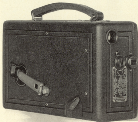
Ciné-Kodak, Model B, a motion picture camera in a hand camera size

In its complete simplicity and ease of operation Ciné-Kodak, Model B, is a marvel to the amateur and a delight to the expert. Hand cranking is entirely eliminated; the motive power is all in a spring motor which controls the timing as well. Load the camera with daylight film, obtainable in either 50 or 100-foot reels—it takes but a second, as easy as loading a Kodak—wind the spring, point the camera at scene or subject, release the lever and the movie's in the making—instantly.